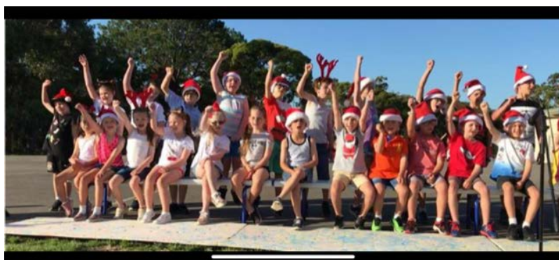
Light the night